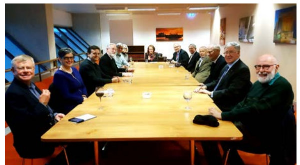
Attendees at the "Eyes on the Spies" Roundtable.