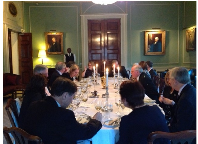
AAL London event on 3 July 2017

reason why such events should be held regularly, including in centres in Australia.