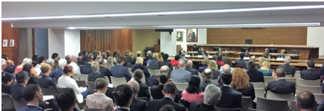
The panellists addressing the audience.

A large audience of some 140 attended the event. A particular feature was that in response to an invitation to those proposing to attend to submit questions that they would like to hear the panel address, no less than 19 questions were submitted.