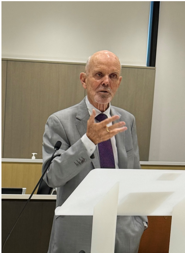
Professor Philip Pettit AC delivering his paper

Professor Pettit is the Laurance Rockefeller University Professor of Politics and Human Values at Princeton University where he has taught political theory and philosophy since 2002, and since 2012-13 has held a joint position as Distinguished University Professor of Philosophy at the Australian National University, Canberra. He was appointed a Companion of the Order of Australia in 2017. In 2023 Professor Pettit published The State (Princeton University Press), a major new account of the state and its importance.