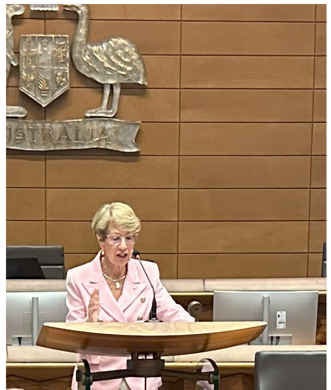
Her Excellency the Honourable Margaret Beazley AC KC giving her paper

Court 1 Federal Court of Australia, Sydney